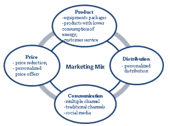
Figure no. 3. Societal marketing mix in green energy field

Most of the measures are mentioned at the level of the communication policy: "to help consumers to become aware using promotional campaigns with tips & tricks for reducing energy consumption", "promoting renewable energy and efficient use of energy", "Green energy should be marketed as a necessity", "promotion through social media", "Promoting the various sources of obtaining green energy", "Promoting in mass media financial advantageous offers for the consumer". An aspect mentioned is related to the diversity of communication channels, so as to provide access to information to the widest possible audience.